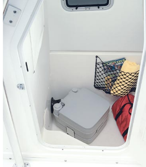
Enclosed head with storage compartments.