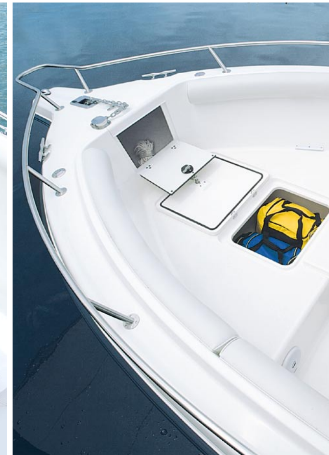
Forward bow area lets you stow anchor and extra gear.