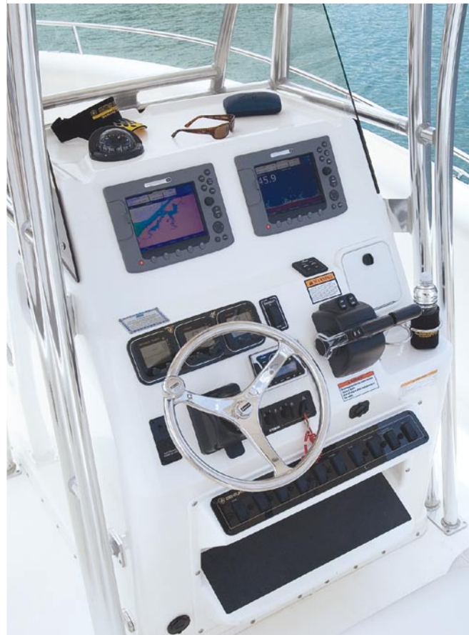
Lockable storage box and console designed to accommodate flush-mount style electronics. (Shown here with optional dual Raymarine® E80s)