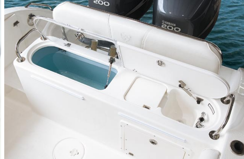
Rear seating opens up to reveal 42-gallon, aerated, calming blue baitwell, complete with sink and fresh/raw water washdown.